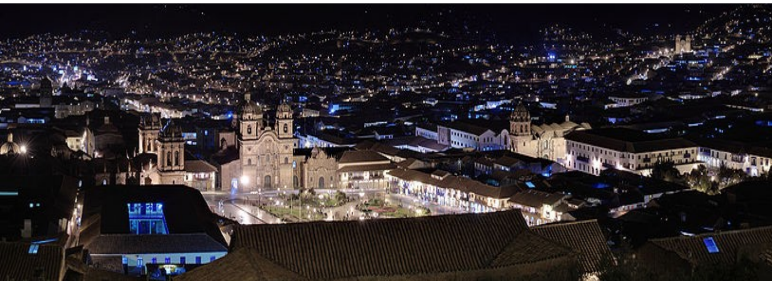
Cuzco at Night