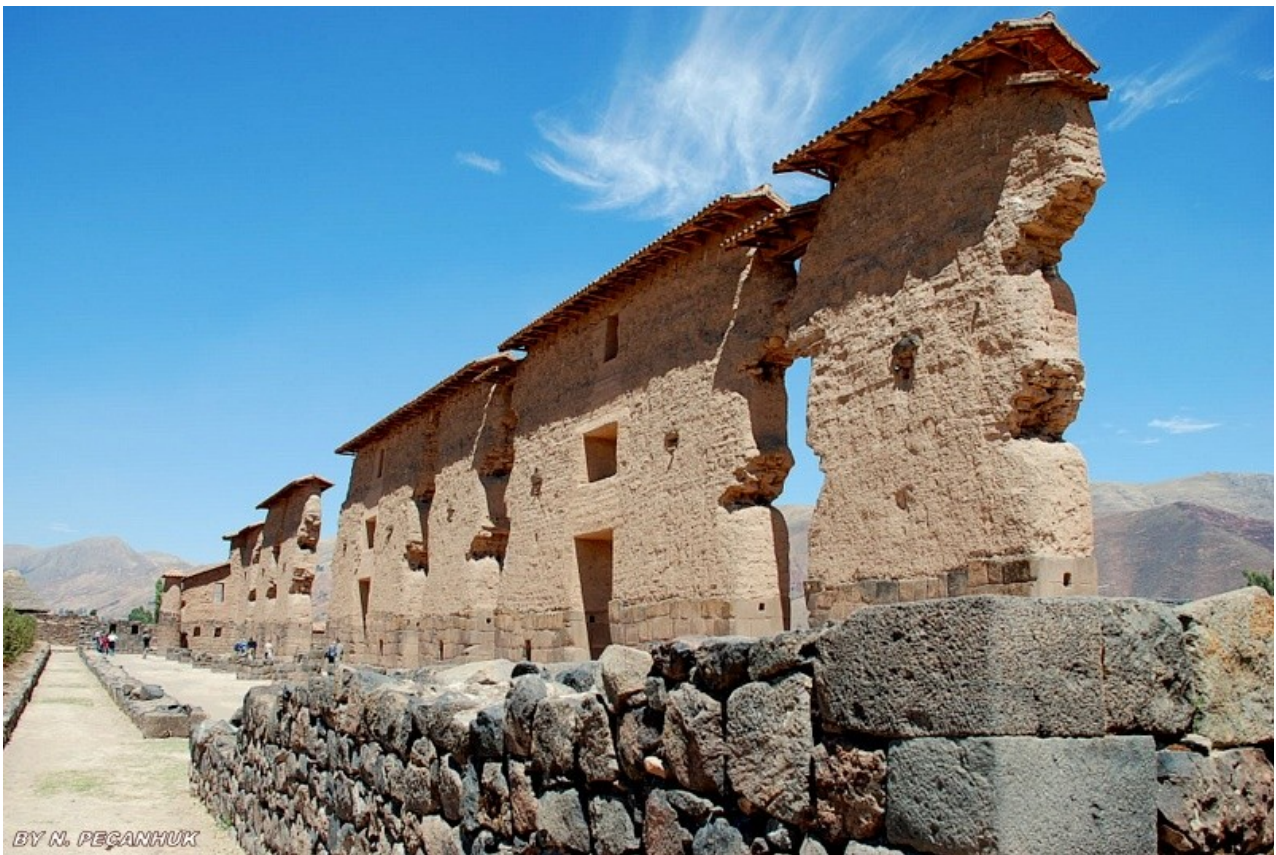
Temple of Viracocha

Overnight at Taypikala Lago Hotel, Chucuito, Lake Titicaca