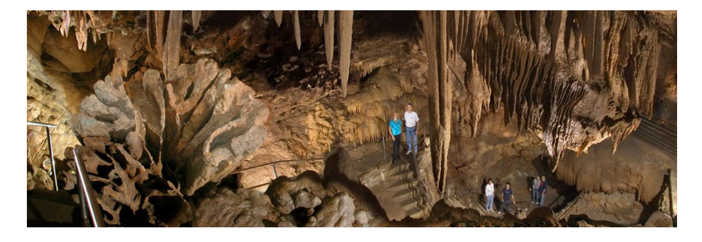
Part of a 40 mile complex of Golden-White Calcite Crystal Caves